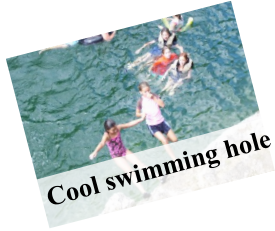
Cool swimming hole

(For children who have completed 3rd - 5th Grade)