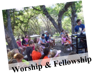
Worship & Fellowship