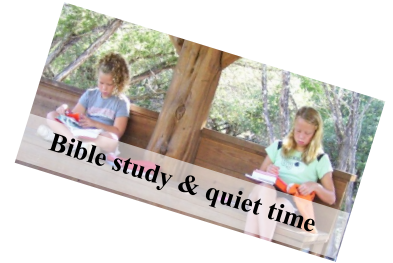
Bible study & quiet time